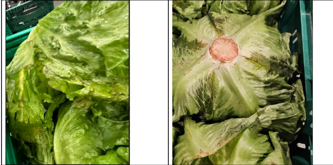
Shredding / Damage